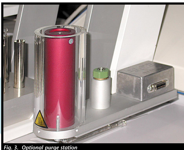
Fig. 3. Optional purge station