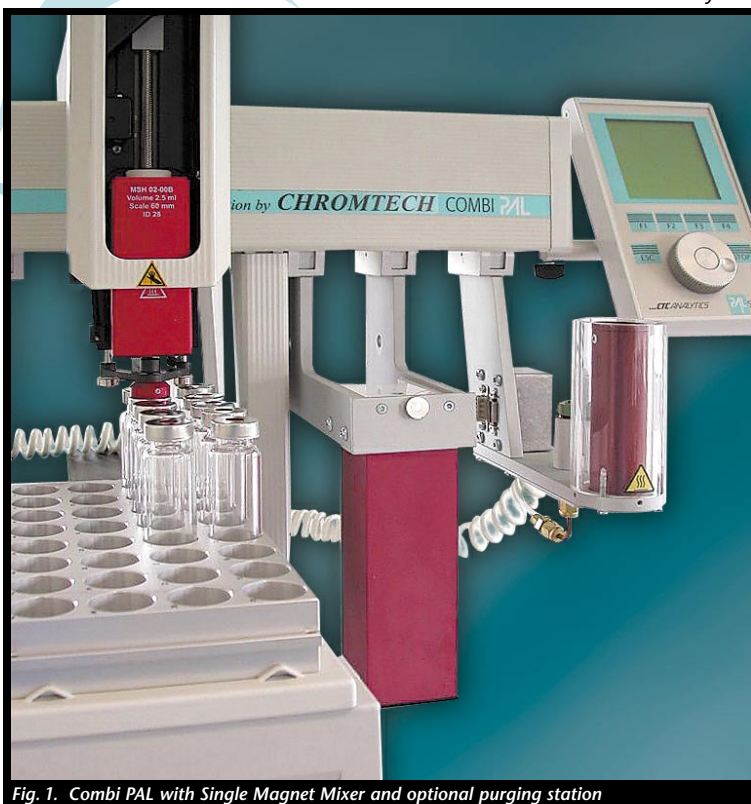
Fig. 1. Combi PAL with Single Magnet Mixer and optional purging station

This is especially true for PDMS fibers, which are known for having a longer lifetime than other fiber materials. The SMM immerses the fiber in the liquid, and the magnet inside the vial provides a fast equilibrium between the fiber and the sample. The sampling takes place while the system is closed. Data show that the SMM has favorable reproducibility and up to 15% higher response rates than an agitator. This ratio increases with higher boiling compounds.